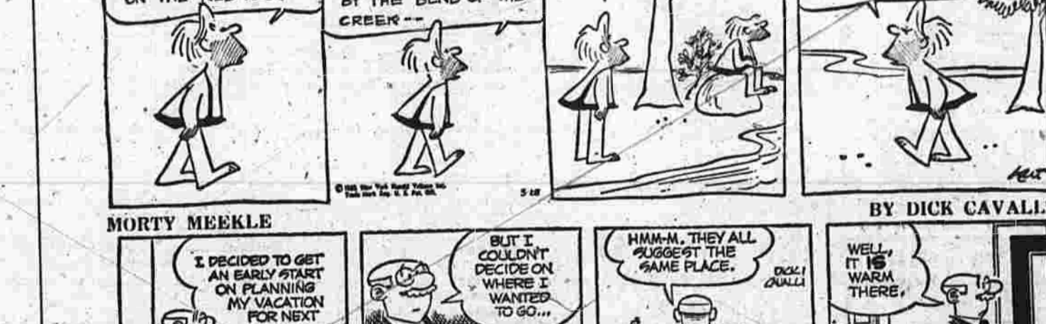
MORTY MECKLE BY DICK CAVALLI