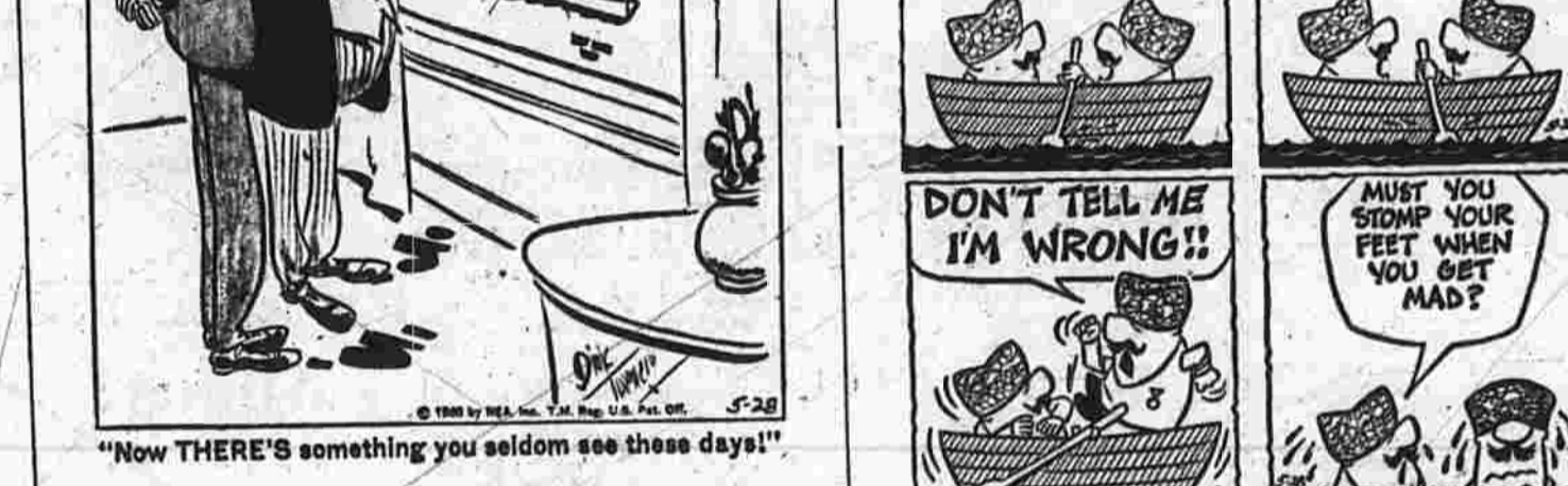
LITTLE SPORTS BY ROUSON